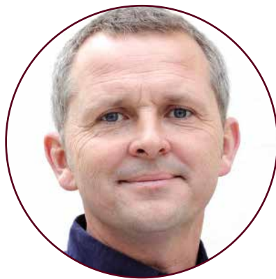
Richard Boyd Barrett